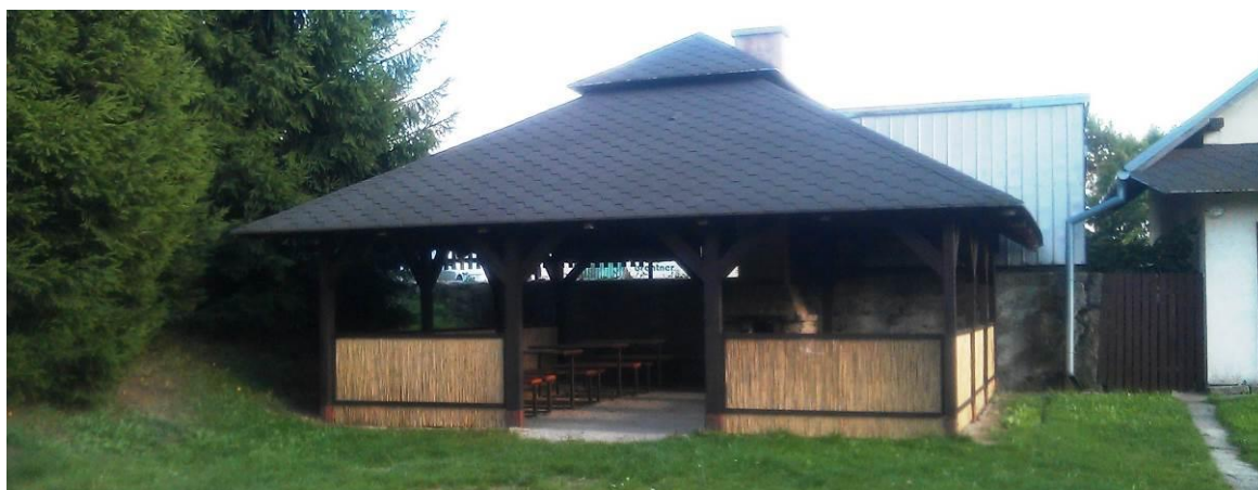
Picture No.9 The club outdoor sitting