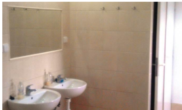
Picture No.8 Sanitary equipment