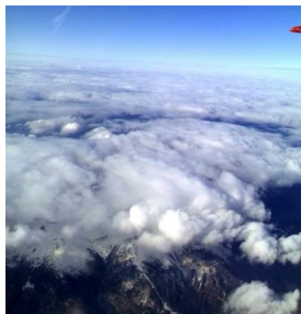
Picture No. 4 North wave