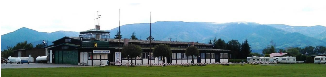
Picture No.2 Hangar with background Lucanska Mala Fatra - Martinky