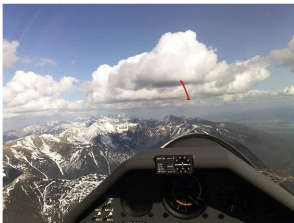
Picture No.5 Liptovske Tatry