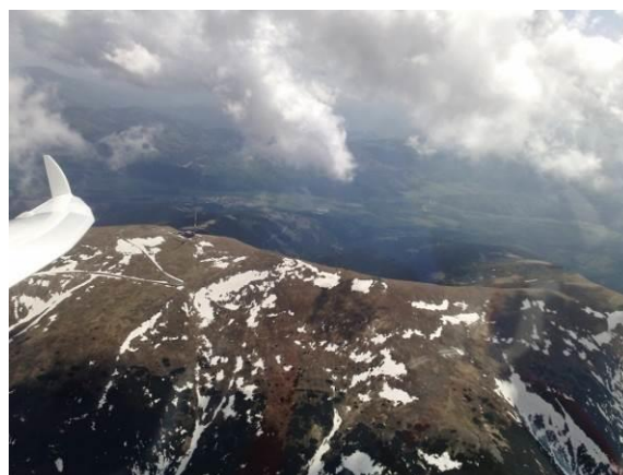
Picture No.6 Kralova Hola