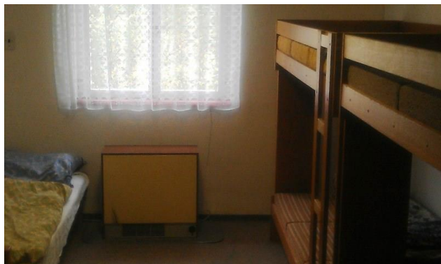
Picture No.7 Room tourist hostel