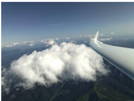
Picture No. 3 View of the rotor northern waves