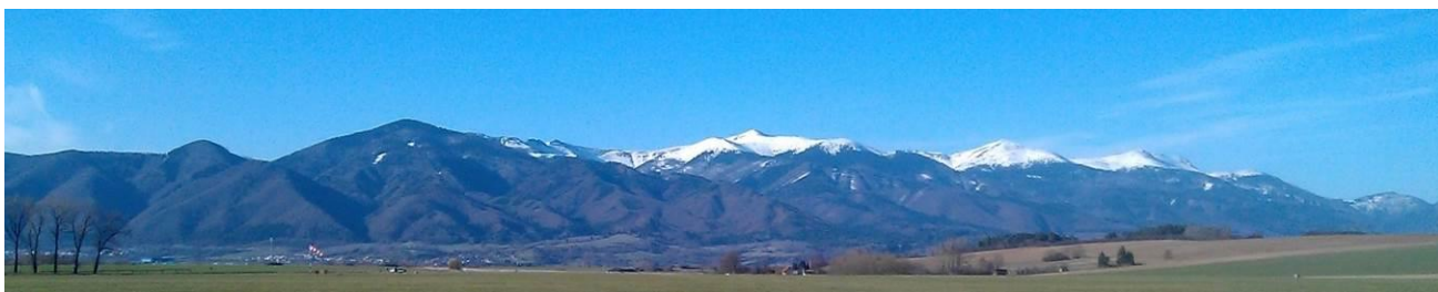
Picture No. 1 Krivanska Mala Fatra - ideal conditions for flying